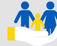
6. GENDER EQUALITY AND INCLUSION