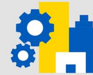
2. REFORM FOCUS