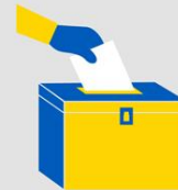
4. DEMOCRATIC PARTICIPATION