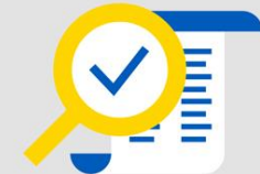
3. TRANSPARENCY, ACCOUNTABILITY AND RULE OF LAW